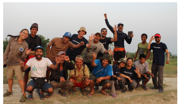
Photo of the expedition team.

“They’re going to carry on,” he says. “The earthquake put them back, but they are still trying to do their work of restoring the river. They’re that sort of people.”