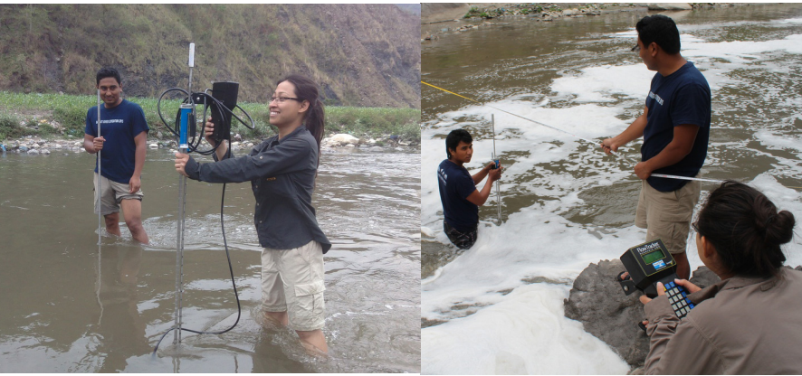
Expedition team members collect flow and discharge data at cross sections along the Bagmati river. More photos of expedition here.

Pimble points out that the FlowTracker allowed the Nepal team to measure water where velocity and depth were below the thresholds of old, mechanical current meter technology. That permitted far greater breadth in site selection and the opportunity to build a much more comprehensive picture of conditions in the river.